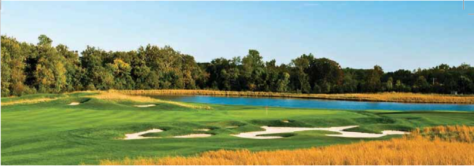
The Bulle Rock Golf Course in Havre de Grace: www.BulleRockGolf.com